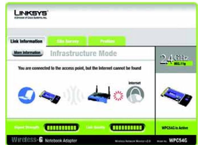
Figure 6-1: Link Information

Click the More Information button to view additional information about the wireless network connection.